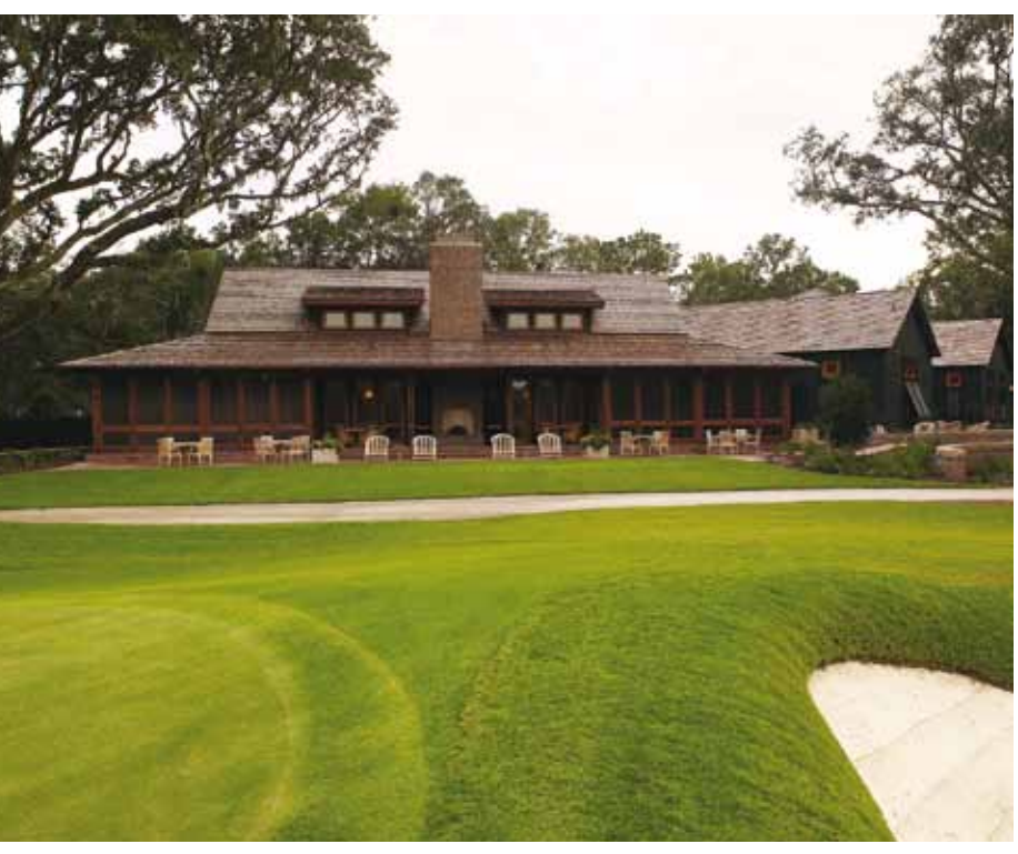
Palmetto Bluffs: an example of a compact clubhouse

DAR Golf Construction Ltd www.dargolf.com ames D'Arcy