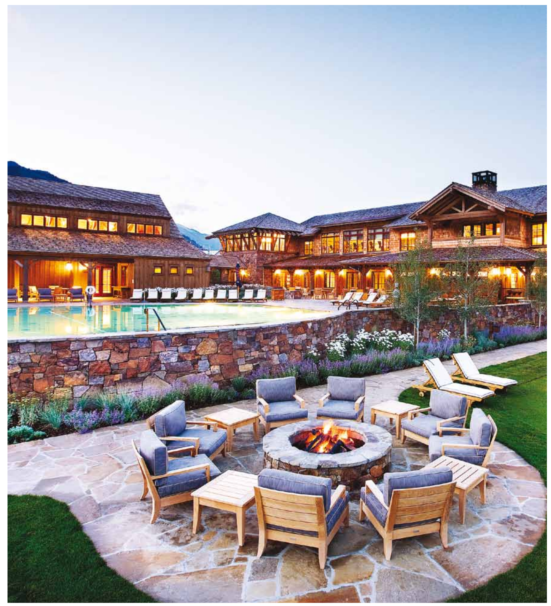
Shooting Star in Jackson Hole, Wyoming

But across the world, developers and masterplanners are adapting to the new reality, and, steadily, are starting to do more business. The business has changed, but the fundamentals are still the same: people like golf, they like beautiful places, and they like good weather.